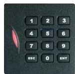
KR101-E Mullion Mount Prox Card/Fob Reader